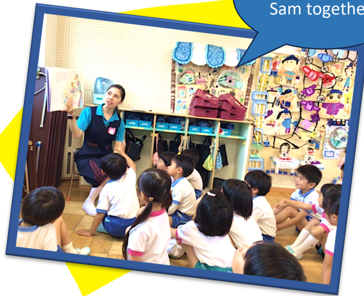
We can read Sad Sam together!