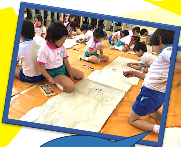
Let's decorate our rides!