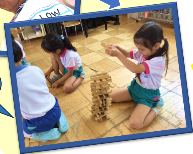
Let's play in English!