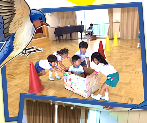
Push and pull as fast as you can!