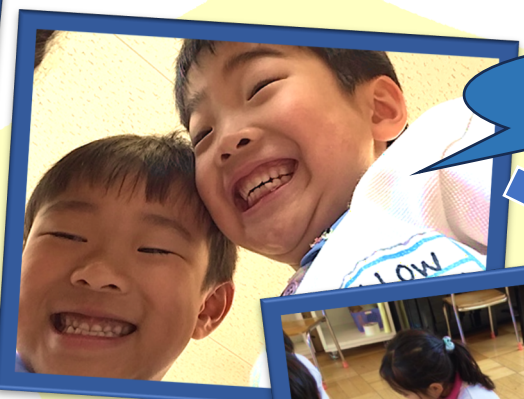
We took this picture!