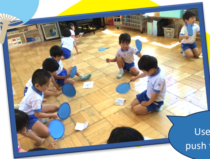
Use wind to push the paper!